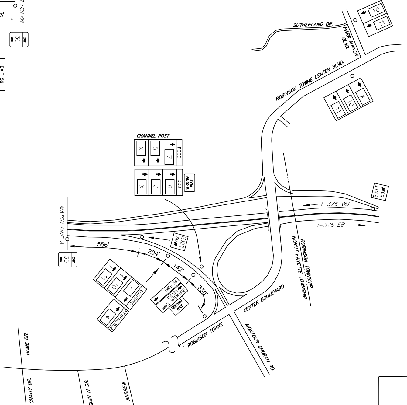
SCHEMATIC PLAN NOT TO SCALE

14'Hx13'W W14x30 A572 3M TYPE III B650 - #2, #2